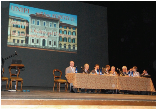
Figure 2: Welcome address at Verdi Theatre

NURETH is the key series of international topical meetings devoted entirely to the advancement of knowledge in nuclear reactor thermal-hydraulics and related areas. It covers a wide range of topics related to the different types of current and future generation nuclear reactors.