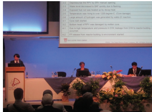
Figure 3: Lecture about Fukushima Dai-Ichi accident analysed by MAAP code

The Conference included six oral conference sessions over the four and half day conference program. They are subdivided in: (S1) Basic Thermal-hydraulics; Two Phase Flow and Heat