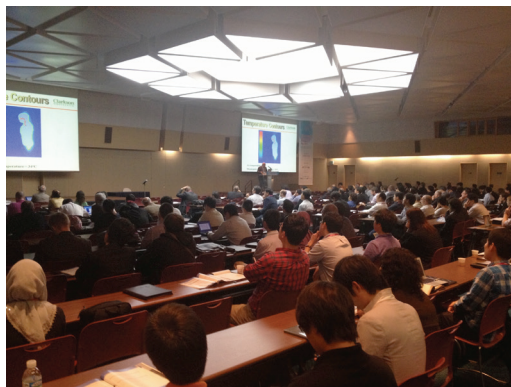
Figure 5: Photo of a plenary lecture in ICMF-2013