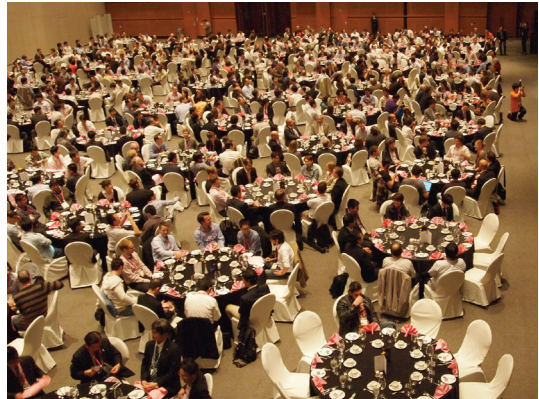
Figure 6: Photo of the Reception Dinner in ICMF-2013

http://www.vki.ac.be/eurotherm2013/index.php