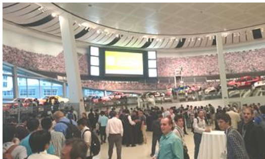
Photo 1 Opening reception at NASCAR Hall of Fame

co-held with 2016 Power & Energy Conference for the first time. Total attendance was 1,671 (counting both ICONE and Power & Energy) and nearly 600 technical presentations were given for ICONE.