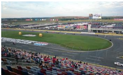
Photo 2 Banquet at The Speedway Club at Charlotte Motor Speedway