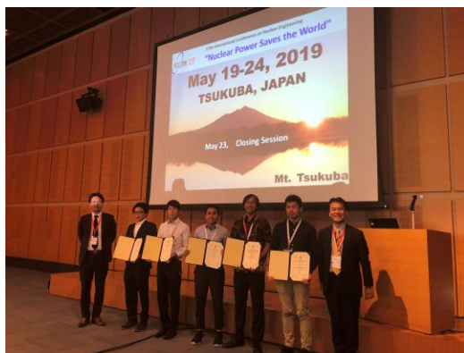
Student Award Ceremony

experienced researchers during the conference. In addition, 20 papers, 20 posters and the best paper (Akiyama Medal Award) were commended in the closing session.