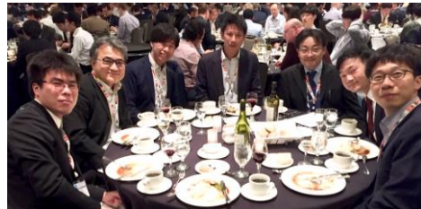
A table in AJK Fluids 2019 banquet

For these topics, 18 additional researchers were asgined as session organizers who chaired individual sessions to promote fruitful discussion among participants.