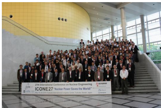
Participants in ICONE27

One of the most important program of the ICONE is "Student Program". 50 students were invited from Japan/Asia, China, North America and Europe using supporting fund by JSME, ASME and CNS. They had fruitful discussions with other countries' students and