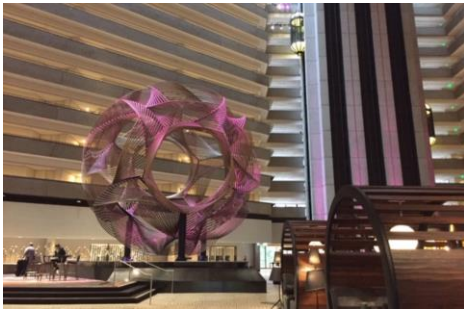
Hyatt Regency San Fransisco